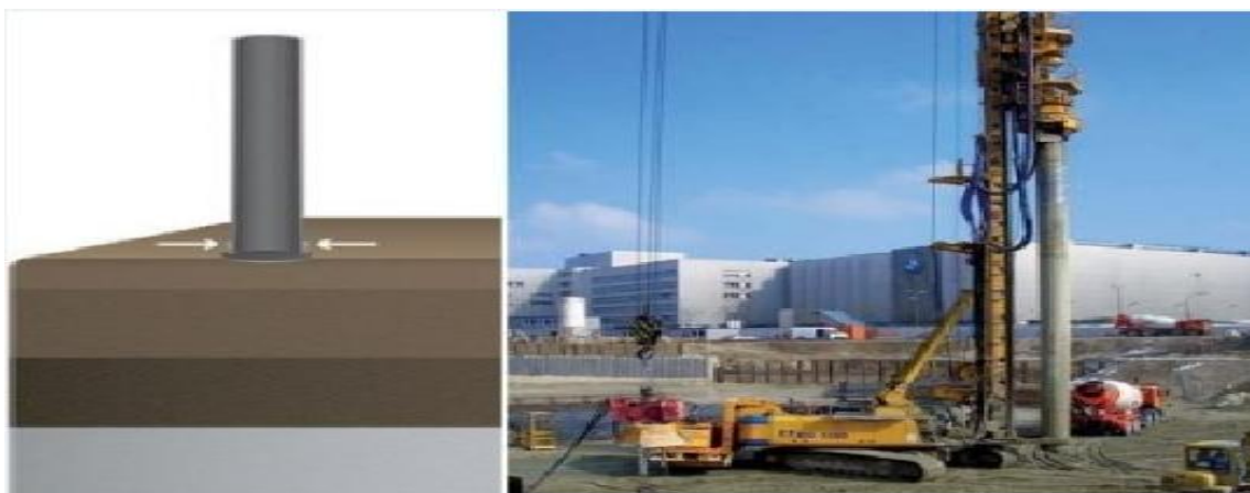
Fig.1: showing boring of cast in situ piles.